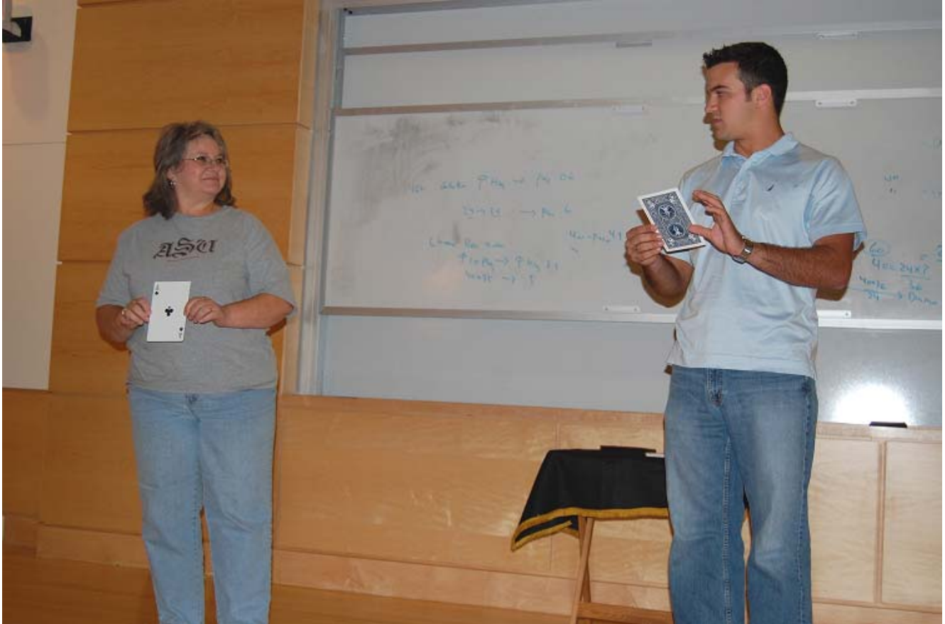
October 4 th Halloween Magic Meeting at Mr. Magic