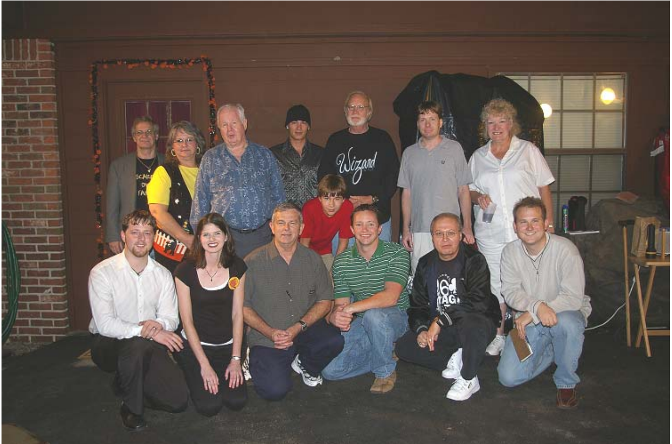
Performers from the Ring 29 Annual Picnic